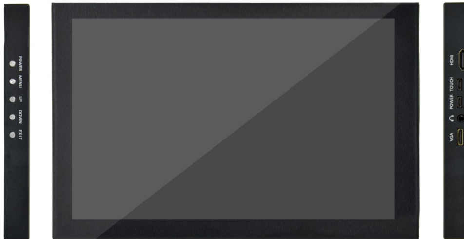
DEBIX TD101H-C (with enclosure)